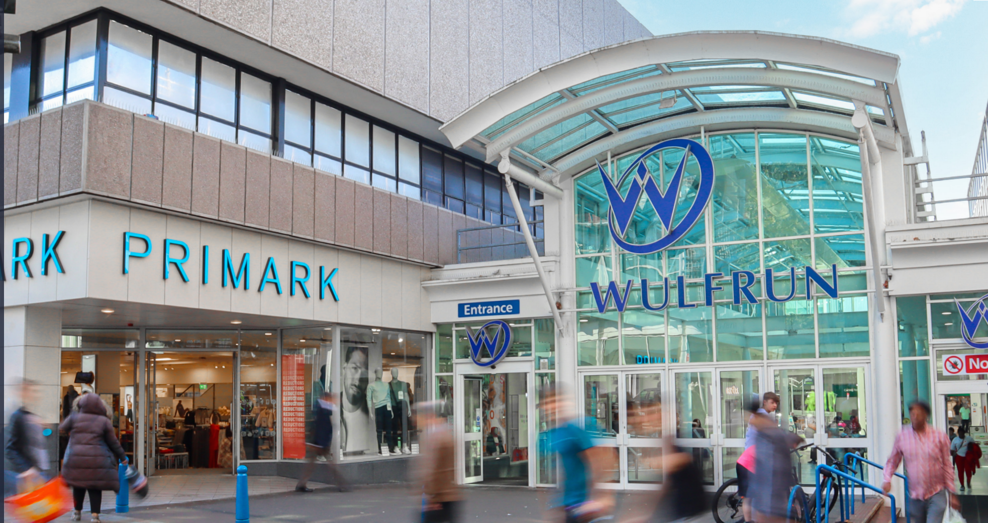
Wulfrun Shopping Centre, Wolverhampton, West Midlands WV1 3HH